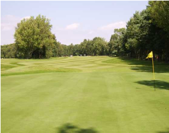
16 th Green