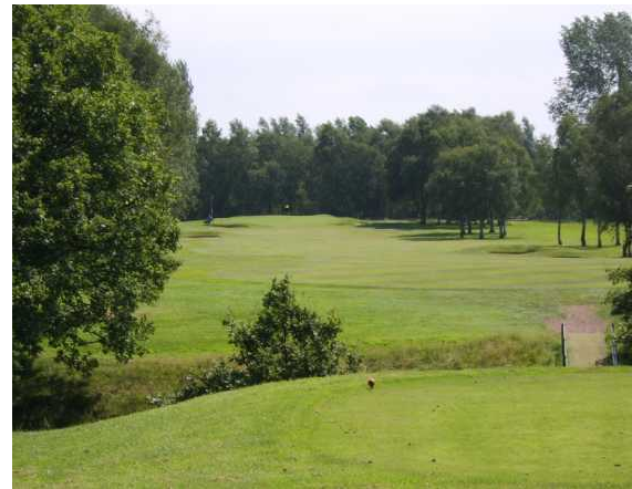
13 th Fairway