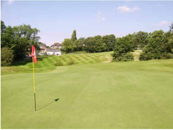
1 st Green