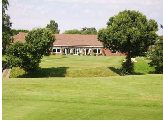
The Clubhouse from the 18 th tee